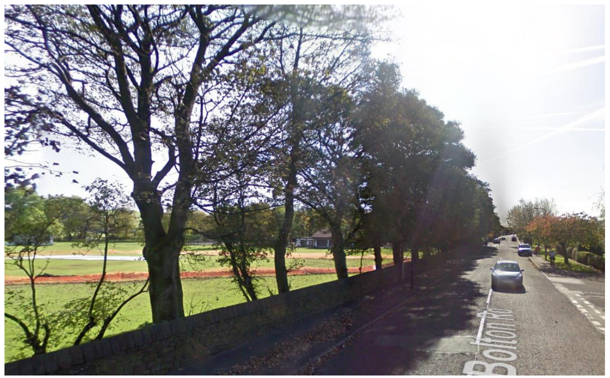
Image 2: Google street view image of group of trees around perimeter of cricket ground facing Bolton Road.