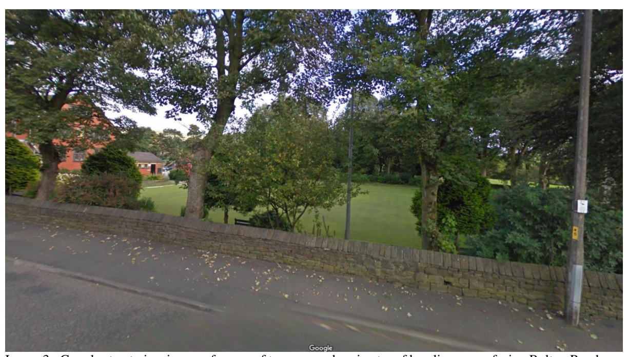
Image 3: Google street view image of group of trees around perimeter of bowling green facing Bolton Road.

2.6 The Council's Planning Manager (Development Management) wrote to the current freeholders (North Turton Parish Council), and the current leaseholders (Edgworth Cricket and recreation Club and Edgworth Bowling Club on the 17<sup>th</sup> October 2019., explaining that a formal notice under the Town & Country Planning Act 1990, Town & Country Planning (Tree Preservation) Regulations 1999 as amended by the Town & Country Planning